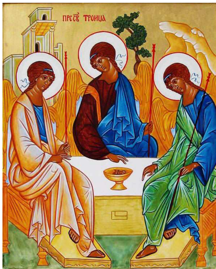
Orthodox Icon depicting the Trinity as the three visitors to Abraham (Genesis 18:1-15) The Holy Trinity Sunday, June 7, 2009 With One Voice: Setting Five